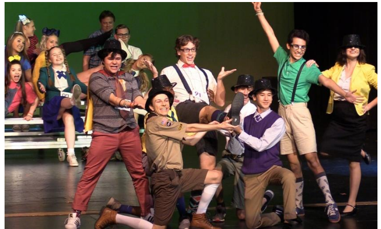
25 th Annual Putnam County Spelling Bee

The CHHS Theatre production of 25 th Annual Putnam County Spelling Bee opened on October 4 and the crowd reaction proves the show is a hit. Showcasing the talent of our CHHS Theatre students, this witty musical has elements of improv, big production numbers, and even enlists audience members to get on stage and participate in the Bee. Each performance is different, with cast members sharing parts and the unpredictable element of audience participation. You only have a couple of dates to come and see Putnam before it closes. And if you have seen it already, then you need to come back and see it again. It's that good and that different each time.